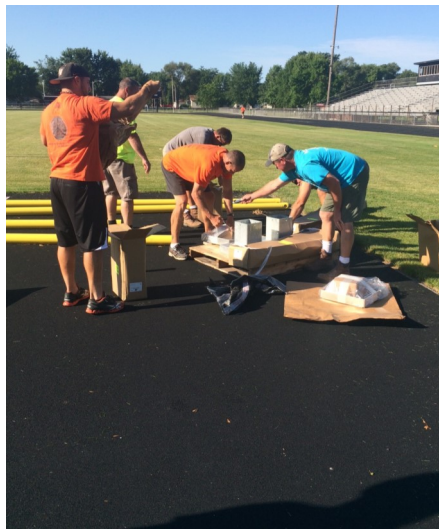
Helpers with the new goal posts